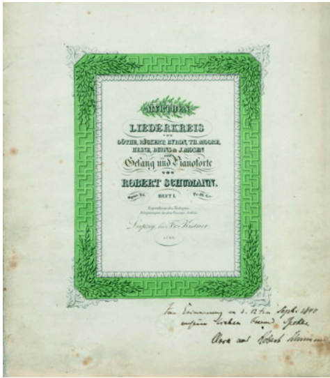
Title page of first printed edition with autograph dedication