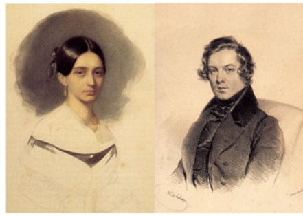
Portraits of Clara and Robert Schumann, made around the time of their wedding